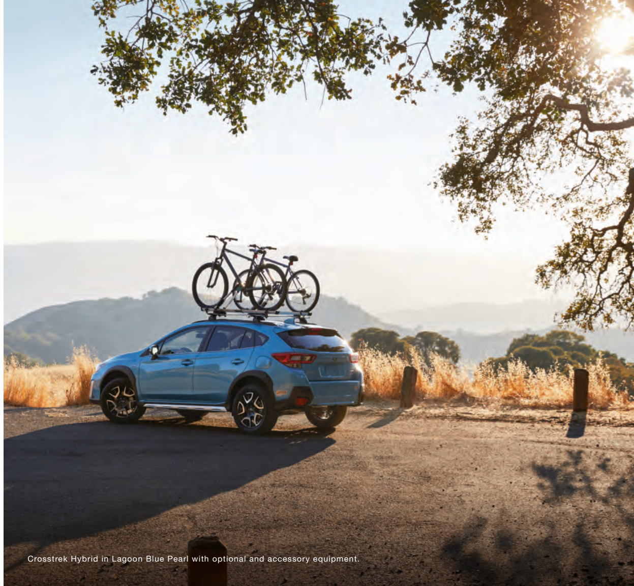
Crosstrek Hybrid in Lagoon Blue Pearl with optional and accessory equipment.