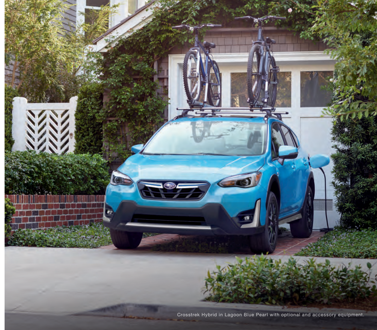
Crosstrek Hybrid in Lagoon Blue Pearl with optional and accessory equipment.

Battery Save Mode preserves the battery level for later use. Battery Charge Mode uses the gas engine to charge the battery, adding up to four miles of electric range for every 30 minutes of driving.